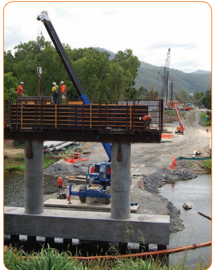
Construction underway on one of the 15 bridge piers

Some 5,000 native seedlings will be planted nearby as the project progresses and pest species will be removed.