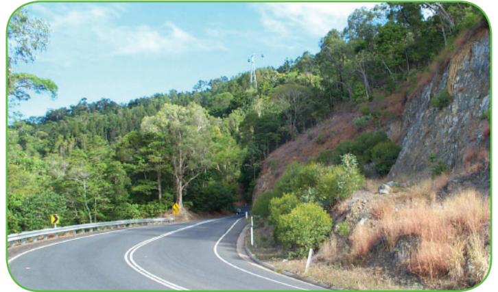
Kuranda Range Road

Work will start early December on a $1.1 million curve widening project on the Kuranda Range Road that will include the widening of the range road width near Avondale Creek and the hairpin bend.