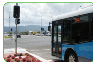
Cairns’ first priority bus lane

The bus lane is located next to the inbound traffic lanes near Balaclava State School and allows public buses to queue in a separate traffic lane.