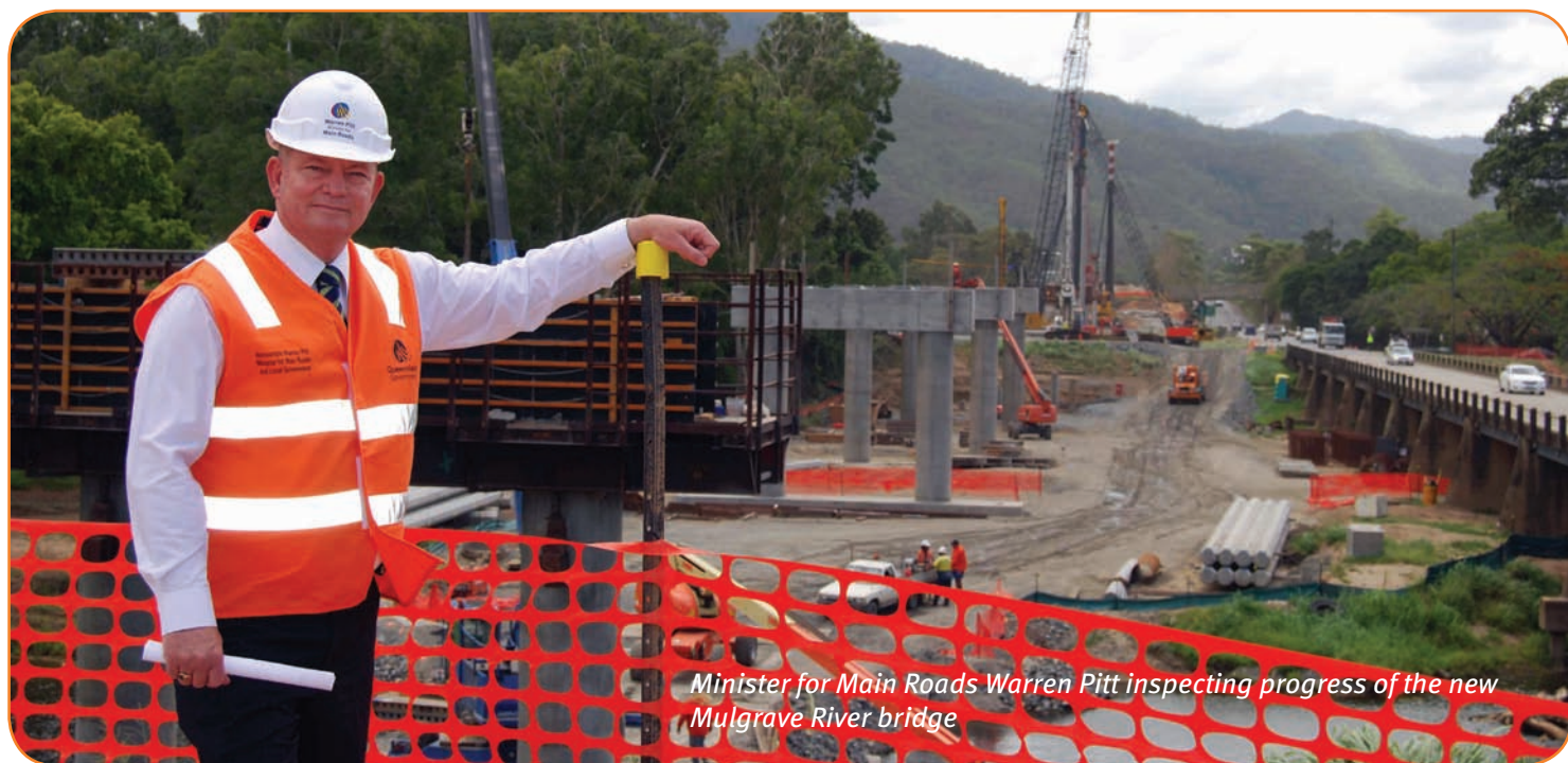
Minister for Main Roads Warren Pitt inspecting progress of the new Mulgrave River bridge